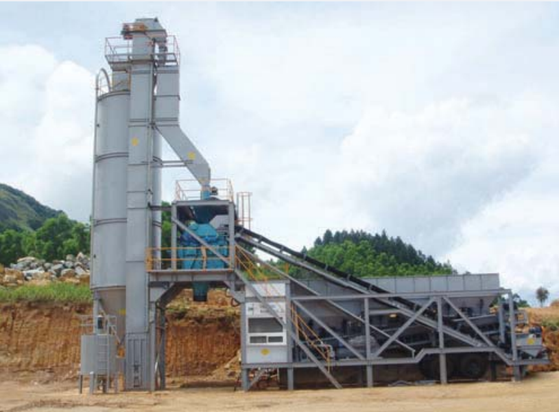
Mobile Concrete Batcher Plant

Mobile Concrete Batch Plant offers many advantages over previous the other type concrete batch plant.